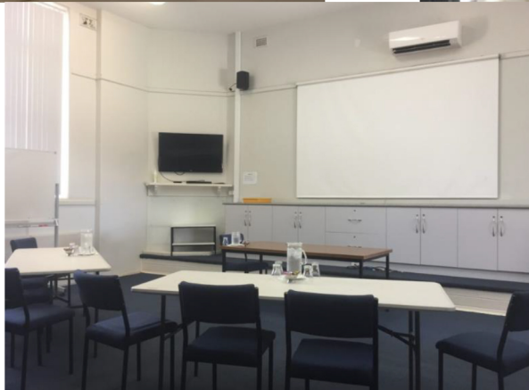
Library / Meeting Room