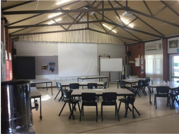
Dining Hall / Conference Room