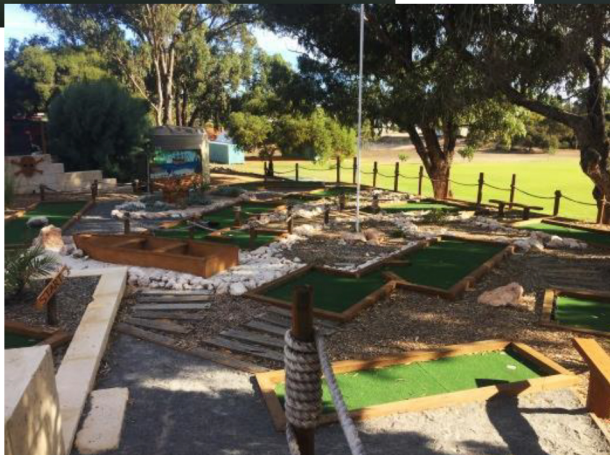
Mini Golf Course