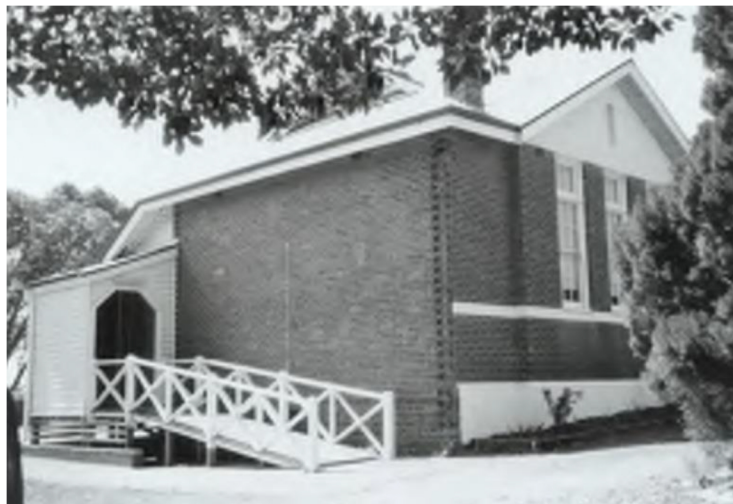
South east corner of the original school building (1966)

Any proposed change should not unduly impact on the heritage values of the place and should retain significant fabric wherever feasible.